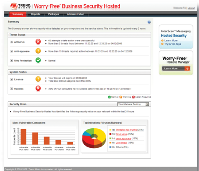
WFBS-H console displaying the status

Note: Full account user names do not begin with a '#'. .